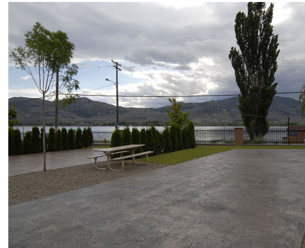
Titled RV Lots Available Now!