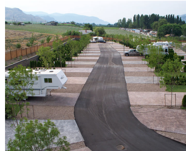
Waltons's Lakefront RV Resort

8312 Main Street Osoyoos, BC Ph: 250-495-6522 Fax: 250-495-3363 1-800-882-1966